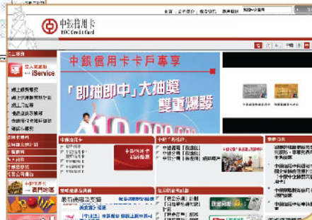
2 BOC Credit Card Internet Banking